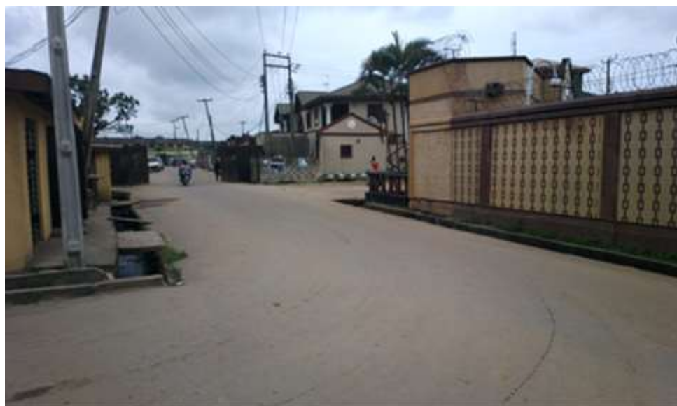
Figure 5. Picture showing a well paved road in the private Estate.

setback for the construction of shops and temporary structures, the private estate have a minimal number of temporary structures. Also private estates have better security arrangement, both in terms of number and effectiveness unlike the public estate that has a porous border and gate, which makes the estate prone to late