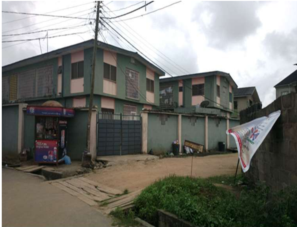
Figure 3. Picture showing the standard of structures and observed setback between structures in the private Estate.