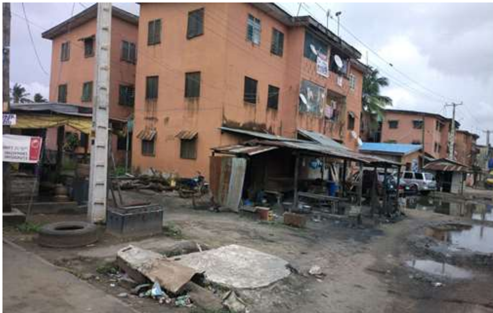
Figure 4. Picture showing the standard of structures and setback not well observed and erection of temporary structures in the public Estate