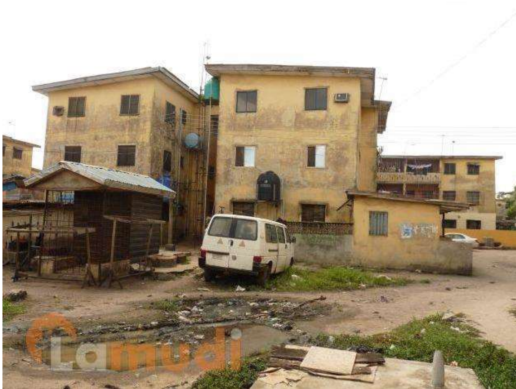
Figure 6. Picture showing the poor state of the road in the public Estate due to lack of maintenance.